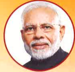
Shri Narendra Modi Hon'ble Prime Minister of India