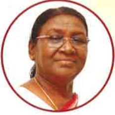
Smt. Droupadi Murmu Hon'ble President of India