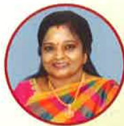
Dr. (Smt.) TAMILISAI SUNDARARAJAN Governor of Telangana & Lt. Governor of Puducherry